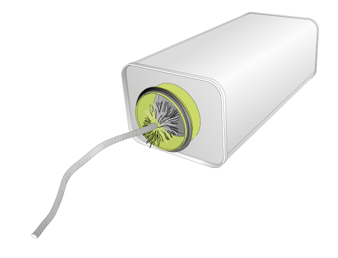
Figure 2. Cleaning with plastic brush

The normal temperature for (continuous) use is between -30° and +50°C.