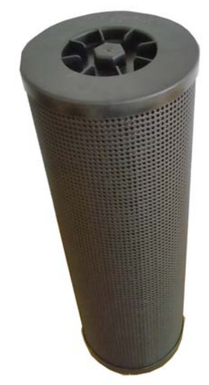
Carbon filter cartridge

There are therefore no open cuts, which makes for excellent corrosion protection.